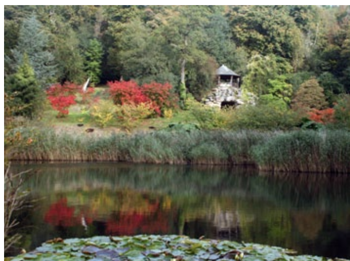
Autumn Colour on the hillside above Chatsworth.