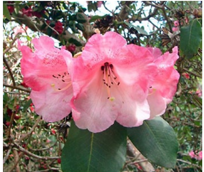
Rhododendron 'Mikado' – one of the plants from Bodnant micropropagated by the Duchy Nursery for Bodnant Garden and the Group (See page 2)

We are fortunate that although all this change has been