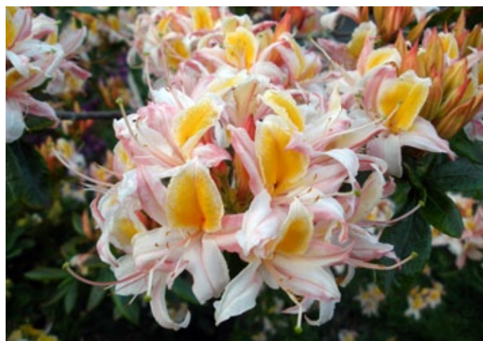
Azalea 'Stopham Lad' (Denny Pratt hybrid)

Our morning was well organised. We started by going into a large out-building where trestle tables had been set up to show off vases of cut blooms. Bear in mind the date of this meeting and you can imagine how amazed we all were. Carrying a welcome cup of coffee we wandered around sniffing and exclaiming at the amount of stuff still at its best.